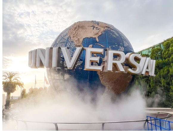
Universal Studios Japan