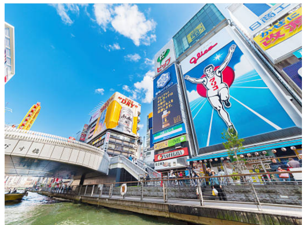
Glico Running Man